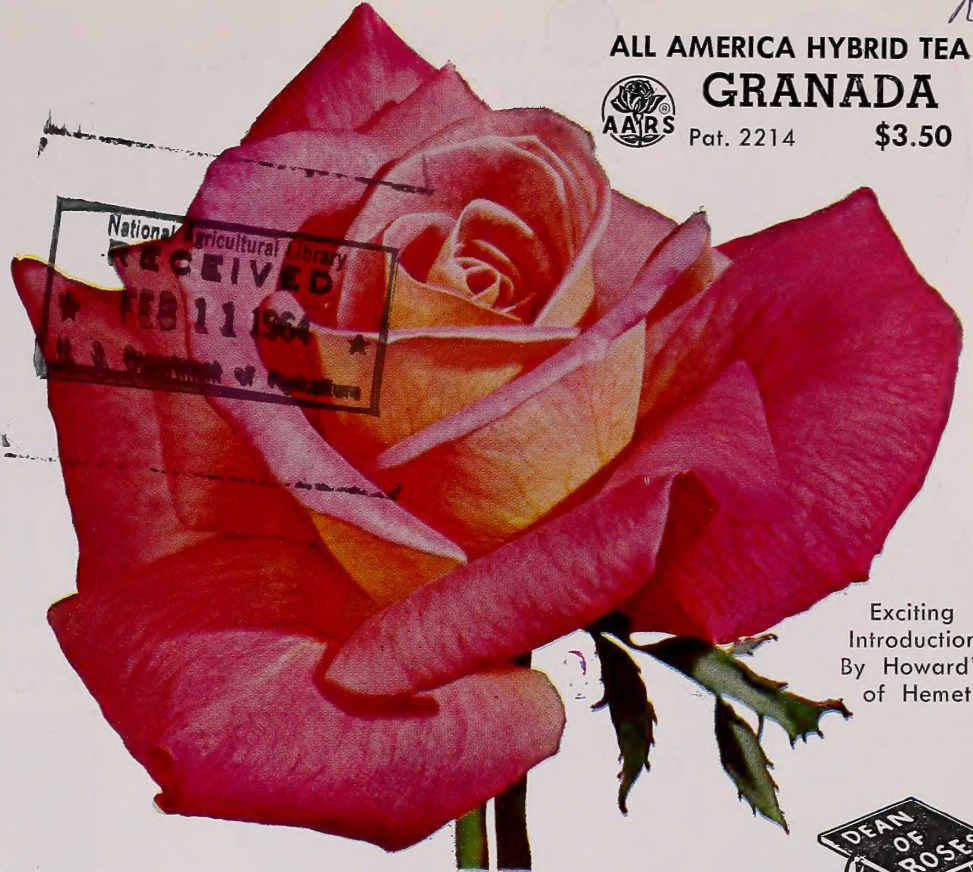
Exciting Introduction By Howard's of Hemet